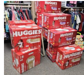
From Quad City Food Shelf